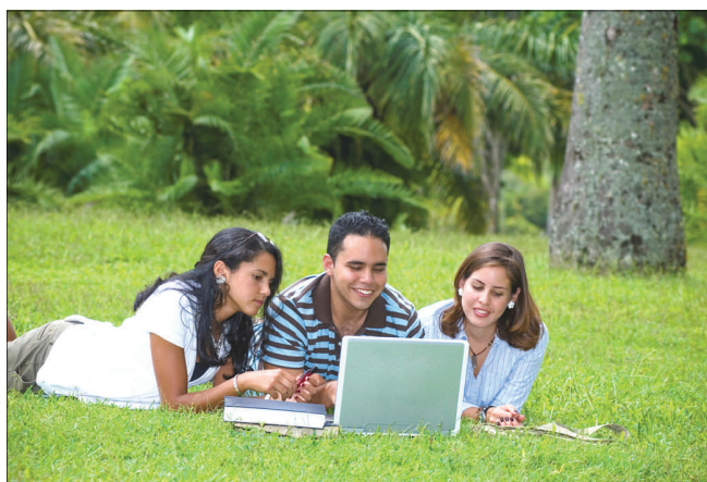
The Virtual Library never closes

Now when we subscribe to a new database or other online research tool, a vendor changes its platform to a newer version—users will know about it right away instead of having to wait until we have enough stories to fill a newsletter issue; then wait until the newsletter is written, printed and published — by which time it's old news!