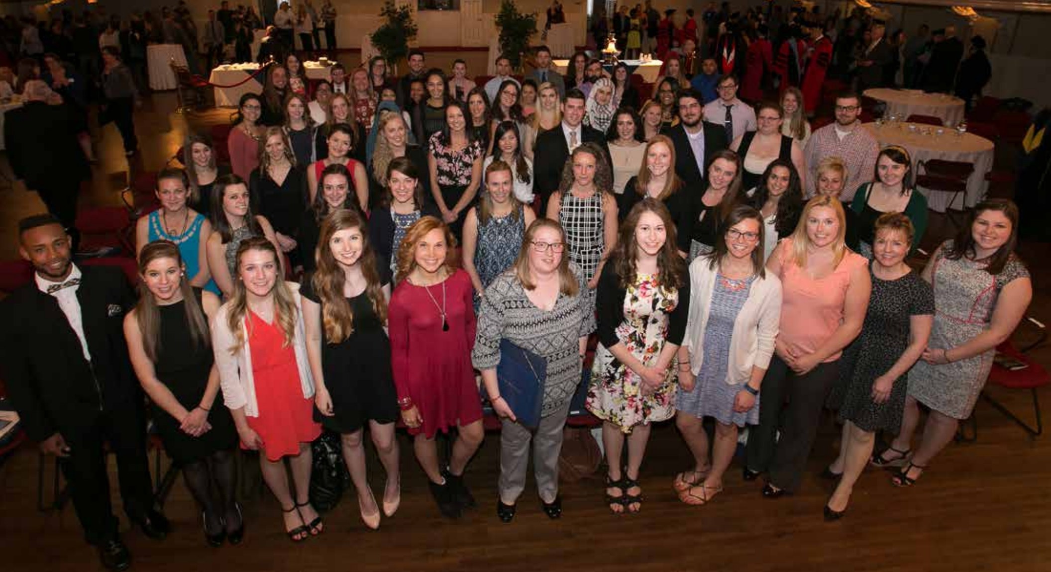
Academic Achievement Award Recipients 2016