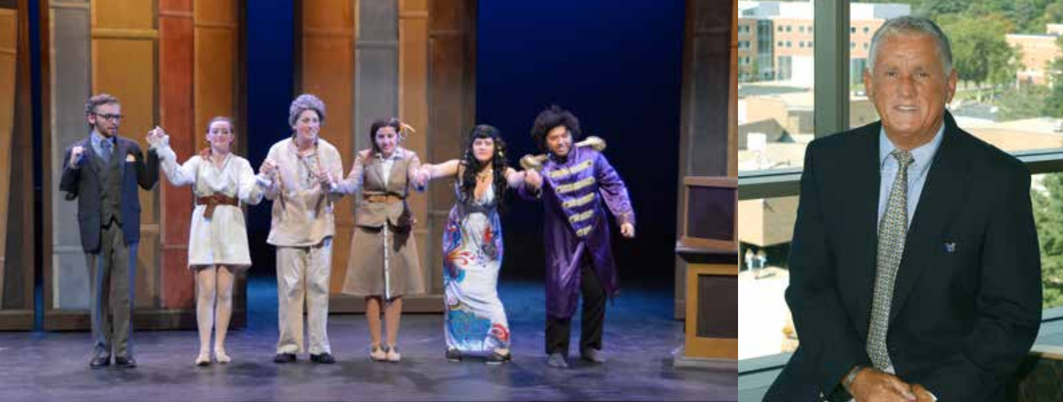
Worcester State University students offer at least one dramatic performance each semester in an outstanding venue, the beautifully renovated Fuller Theater.